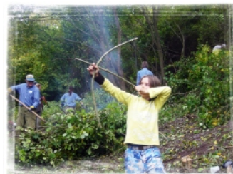
One of the junior members getting to grips with the art of archery!

group of 27 merry workers downed tools on the hill and tucked into fire-cooked potatoes flavoured with garlic