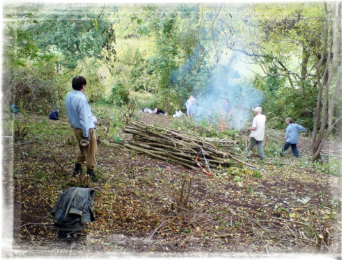
The results of a day of hard graft

Thank you to all the individuals and groups for their support during the last year, especially Thyone Outram for her