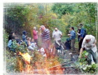
A welcome break from scrub bashing

group of 27 merry workers downed tools on the hill and tucked into fire-cooked potatoes flavoured with garlic