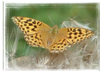
Silver Washed Fritillary - just one of the species the work of Friends of Wolstonbury is enabling to thrive

We have had twelve task days on the Hill carrying out scrub